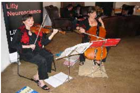
Live music performance at the Spier Congress during a lunch break.

The MHIC, together with the Departments of Psychiatry and Family Medicine of the University of Stellenbosch and the MRC Anxiety & Stress Disorders Research Unit, hosted the first Psychiatry for General Practice Congress at Spier Wine Estate in September. Although we focussed on the Western Cape, healthcare practitioners from across the country (and even some from neighbouring countries and further afield) signed up to attend this two-day meeting where expert speakers addressed topics ranging from the assessment and diagnosis of common mental conditions to treatment and related issues. We received positive feedback from presenters, attendees, and sponsors, with most commenting on the need for this type of conference. We will certainly consider hosting a similar event in the near future.