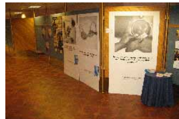
The poster display at Panorama Hospital during Brain Awareness Week.

Brain Awareness Week (15 – 21 March 2004): The 2004 BAW was launched with a Media Tea that resulted in 2 television news reports, 8 radio interviews, 10 newspaper and 30 internet articles giving coverage of the campaign. A national BAW poster and logo competition for learners, educational talks for lay and professional audiences, live Internet chat rooms, and an educational big-screen video at Canal Walk were some of the events aimed at lay and professional education. The MHIC was honoured to receive a visit from the International Liaison Officer of the European Dana Alliance for the Brain (EDAB) and to have published in the EDAB International Report on Brain Awareness Week. A huge thank you to the support groups and CWTV Canal Walk; the Dean's Office, Health Sciences Faculty, University of Stellenbosch; the Dept of Health: Mental Health Programme; EDAB; Exclusive Books; Health24; Janssen-Cilag; Lundbeck; Novartis; and Panorama Medi-Clinic for supporting this campaign!